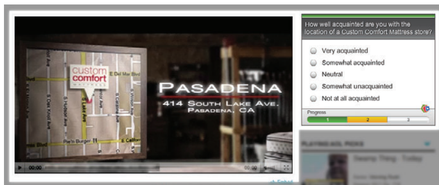
Screen capture: Local Brand Awareness survey in companion banner next to the video

The impact of the localized video ads was measured through real-time surveys which were embedded in the companion banner next to the video ads. Viewers were split into two groups: a control group who saw a standard, one-size-fits-all version; and a main group who saw the personalized videos. Survey responses were compared and analyzed by Stat-Market, a 3rd party analytics research provider.